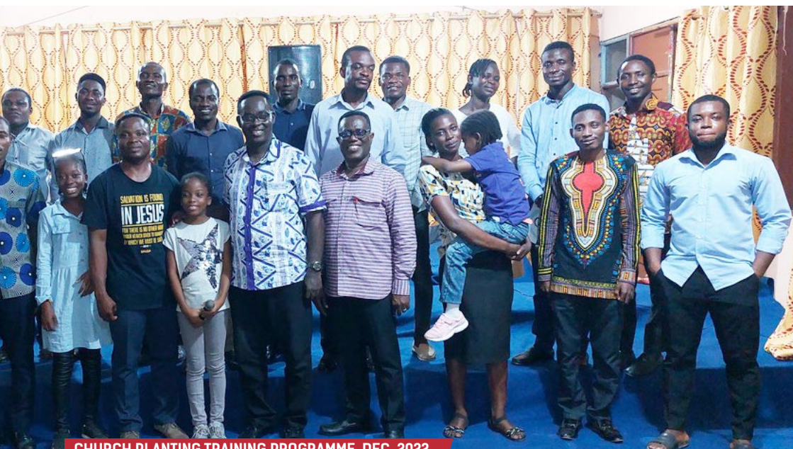
CHURCH PLANTING TRAINING PROGRAMME, DEC. 2022

Are we doing that? We are called to be witnesses of the gospel but nothing else. Are we hasteners of His second coming or idle condemners (Luke 18:10-13)? Sometimes the reason why negative things happen to people is not because they have sinned, but so that God’s glory will be revealed, and Christ’s salvation to the lost is no exception (John 9:1-7).