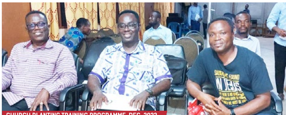
CHURCH PLANTING TRAINING PROGRAMME, DEC. 2022